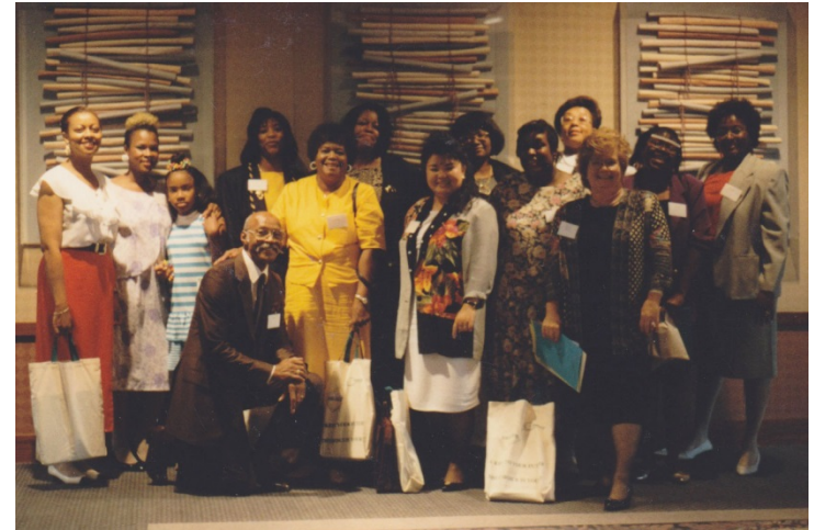
CHWs & supporters pose at the MDPH Advocate Conference in the early 1990s.